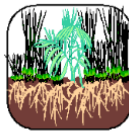
The Weedy Soil