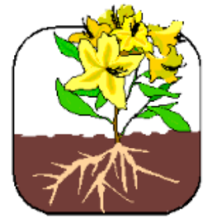
The Good Soil